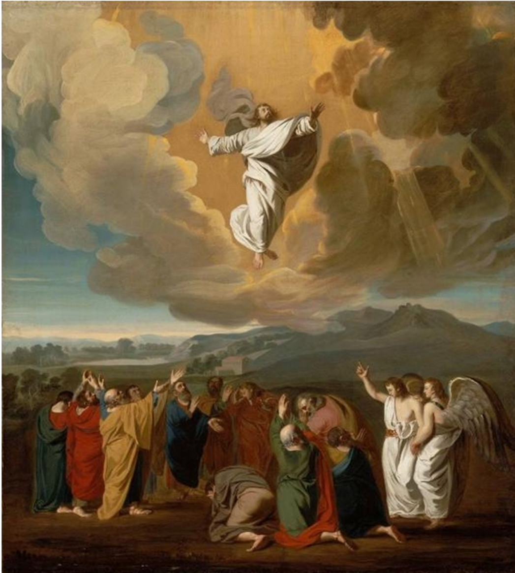
Jesus' Ascension to Heaven - John Singleton Copley, 1775

Grace Evangelical Lutheran Church Tucson, AZ